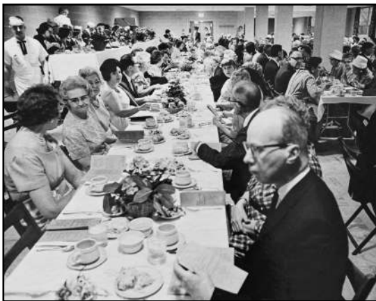
Top: The full-page ad in the Topeka Capital-Journal dated May 17, 1964. Above: The Dedication Ceremony and Dinner held in the basement on May 16, 1964. This is now the Klinge Activity Center in Redwood.

This article was compiled using documents from the Brewster Place archives including The Brewster Place Story: A Dream Come True which was published in 1981 and is the first volume of the history of Brewster Place.