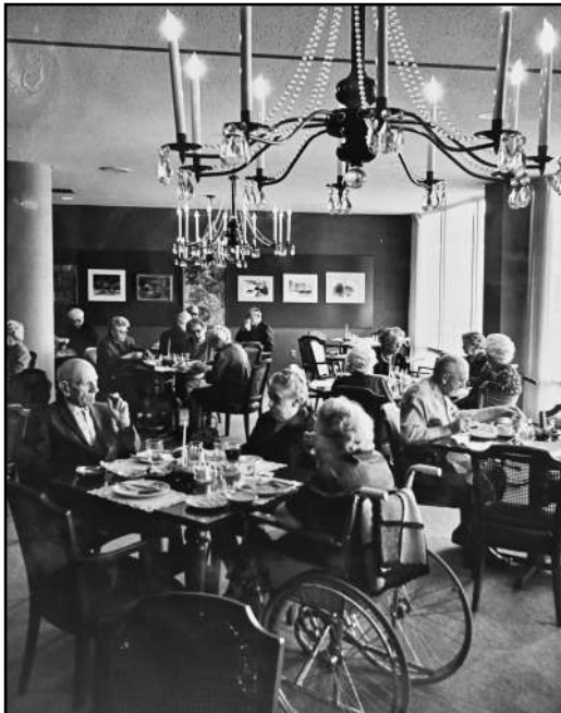
The dining room at Brewster Place in 1964. Note the art gallery wall in the background. Residents dressed in their Sunday best while dining and enjoying visiting with their neighbors.

View archival photos and documents that tell the Brewster Place story through the decades until present.