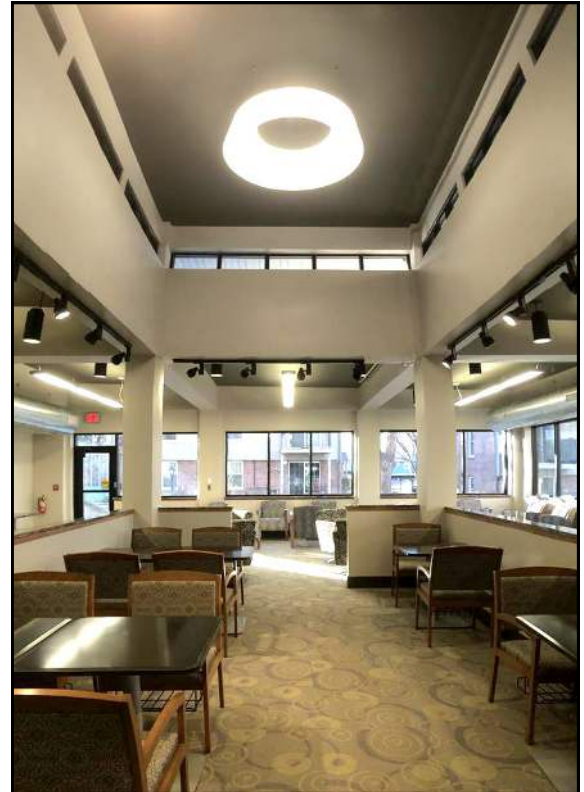
The Main Street Lounge is spacious, light and welcoming. Adding splashes of color from resident designs will enhance the spaces of Main Street.

Once completed, the Main Street renovation will be the centerpiece of our community with the Winchell Wellness Center, beauty shop, bank, Chapel, Market and lounge all in one area. Please call the Foundation office at 274-3327 to see how you can make a lasting gift at Main Street. ■