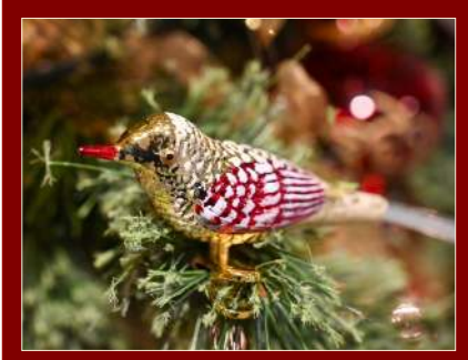
Christmas Eve will find me Where the love light gleams I'll be home for Christmas If only in my dreams

I'll be home for Christmas You can plan on me Please have snow and mistletoe And presents by the tree