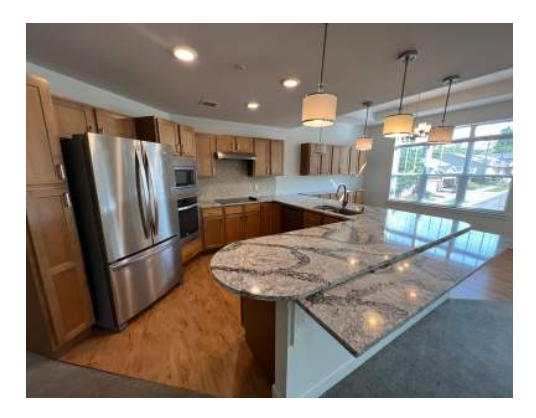
Create your culinary masterpieces in a premium grade kitchen with an in-wall oven and microwave, stainless-steel appliances, and quartz counter tops.