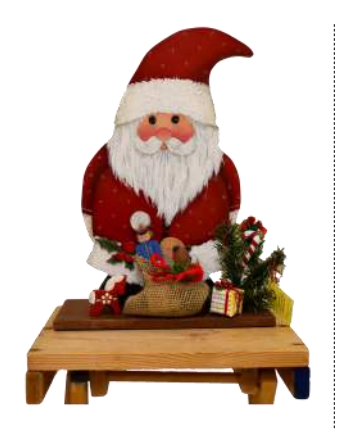
A Topeka tradition...

BREWSTER PLACE ANNUAL HOLIDAY CHARITY BAZAAR